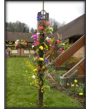
The Easter Cross